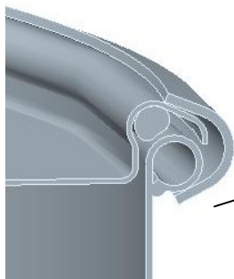
Sanitary seal-welded edging

Geometry of beads and bottom optimized for clean discharge AND for drum cleaning